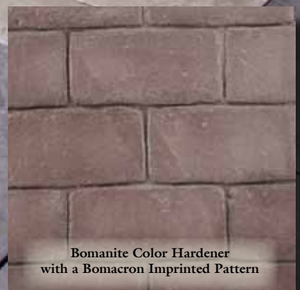
Bomanite Color Hardener with a Bomacron Imprinted Pattern