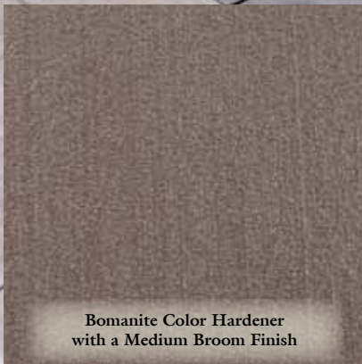
Bomanite Color Hardener with a Medium Broom Finish